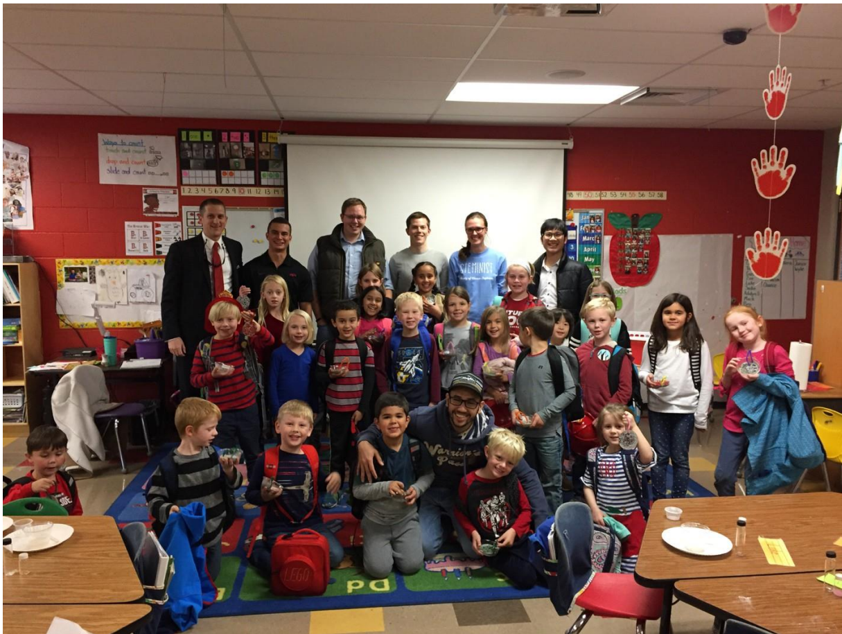
Figure 5. Photograph of the Butterfield Elementary School students and University of Arkansas mentors as part of the Butterfield Elementary Science Club demonstration on fluorescent soils.