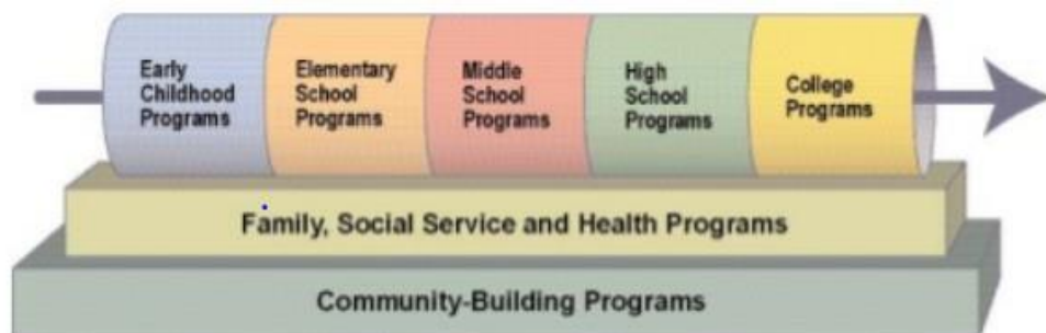
Figure 1. HCZ pipeline model (HCZ Website, 2018).

this project was similar to the successful Harlem Children's Zone (HCZ) pipeline model that is shown in Figure 1.