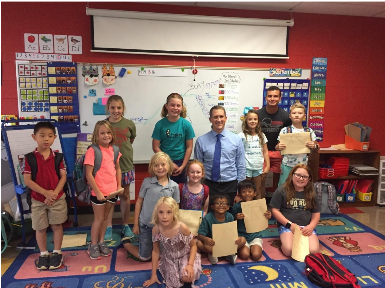
Figure 10. Photographs of 1 st through 4 th grade students completing a hands-on experience during the Butterfield Elementary School Science Club (September 9, 2019). Students shown holding drawings of clay core dams.