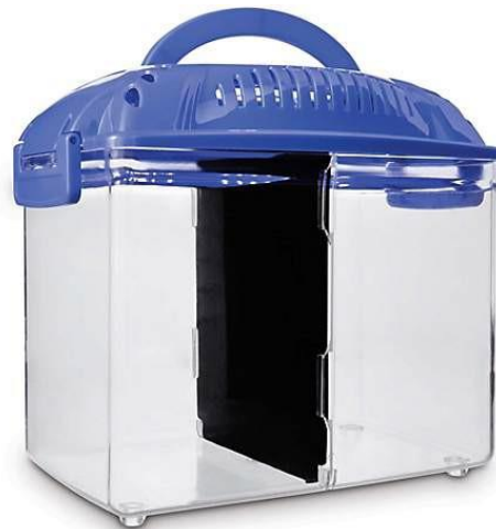
Figure 3. Betta fish dual habitat fish tank, obtained from Petco, and used as a small-scale panel dam (Petco, 2019).

Small-scale plastic panel dams were constructed using 0.8 gallon Imagitarium Betta Fish dual habitat fish tanks that were purchased from Petco (Figure 3). These small-scale dams were initially used for the GirlTREC outreach efforts (4 th and 5 th graders) on July 9, 2019, then were reused for the Butterfield Elementary School outreach efforts (1 st -4 th graders) on September 9, 2019, and then were reused again for the Village of Promise